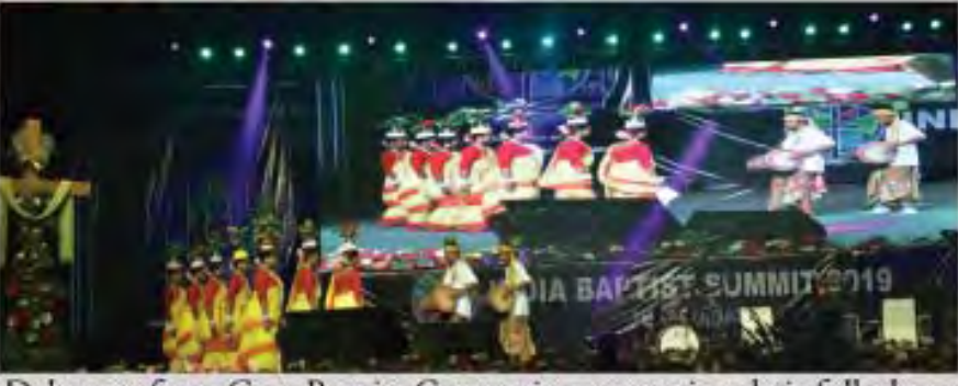
Delegates from Garo Baptist Convention presenting their folk dance