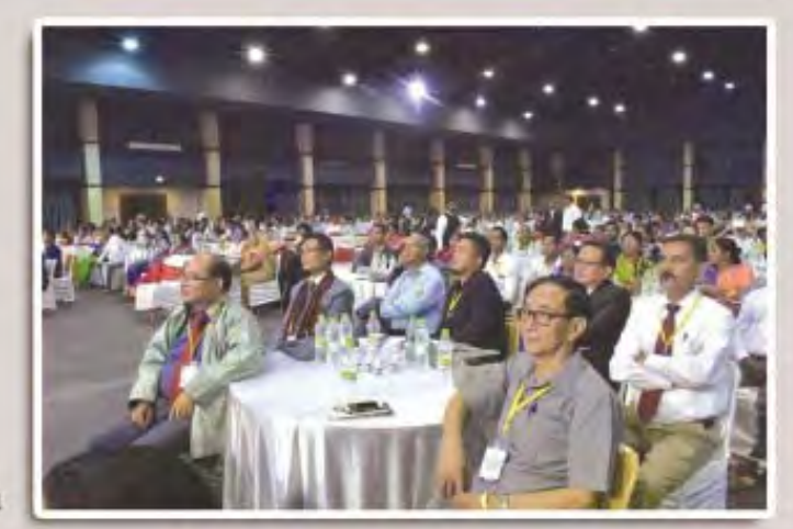
Leaders from North East India