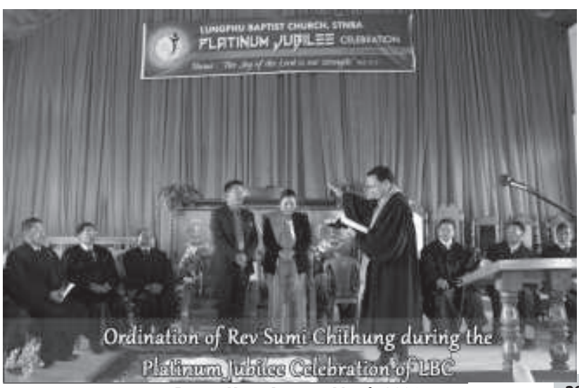
Baptist News, January-March 2016

Organized by few committed individuals who have burden to pray for the Nation, a conference was conducted at Kerela. A huge