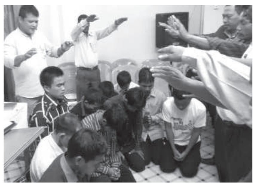
Graduation Program of the India Gospel Mission