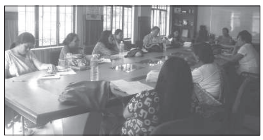
January - March, 2011