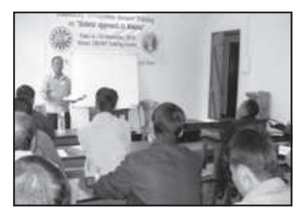
January - March, 2011

Through the initiative of the Secretariat, we were able to organize a special program for Guwahati street Children in partnership with Guwahati Street Children Program World Vision India on the 11<sup>th</sup> December, 2011. Altogether 50 children attended