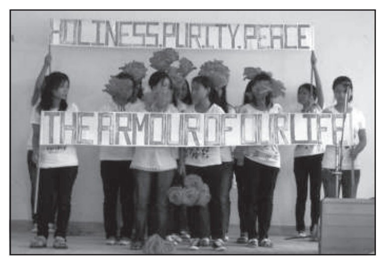
January - March, 2011

§ Condom campaign is often misunderstood and misused by many young people. This misunderstanding leads them as an endorsement to free and premarital sex. Without any inhibition this is recklessly slaughtering the morality of our young people. Once our morality is gone we shall no more be called a human ` Therefore, the True Love Waits takes a positive, healthy and Biblical approach to bring about healthy behavioral changes, to reduce HIV and AIDS endemic, to rebuild the spirituality and morality of the land, to see God intended and wholesome family and to raise good and responsible leadership.