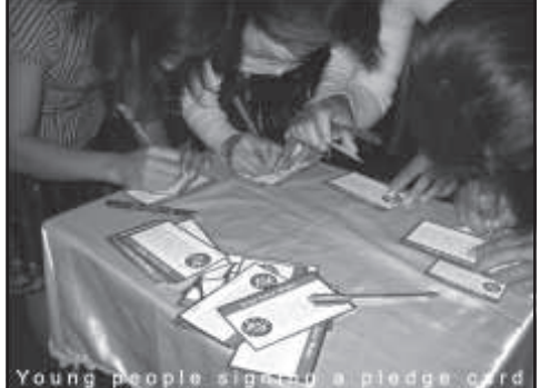
January - March, 2011

§ A significant number of teenagers were publicly