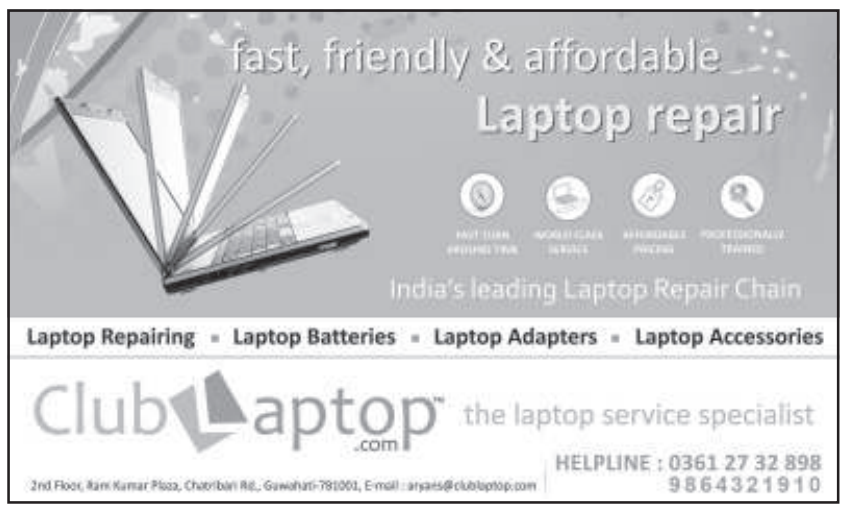
January - March, 2011